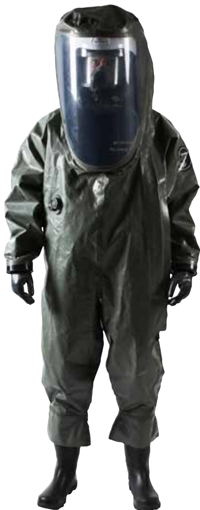
Type VP1 with sewn-in socks/booties and separate boots.

TRELLCHEM® EVO provides maximum protection against hazardous chemicals in liquid, vapor, gaseous and solid form, including warfare agents. TRELLCHEM® EVO is fully certified in accordance with the American standard NFPA 1991:2016, including the optional chemical flash fire and liquefied gas protection requirements.