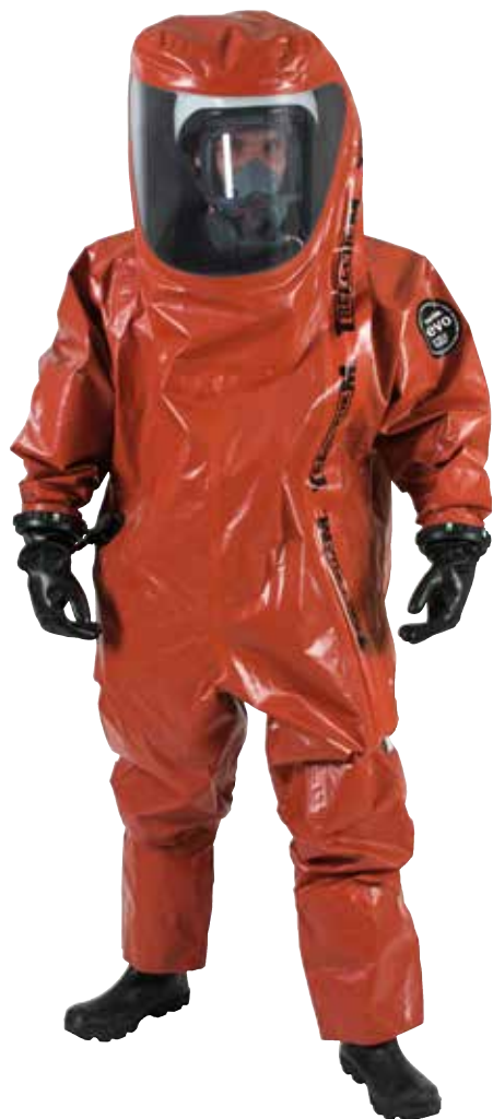
Type CV with sewn-in socks/booties and separate boots.

TRELLCHEM® EVO provides maximum protection against hazardous chemicals in liquid, vapor, gaseous and solid form, including warfare agents. TRELLCHEM® EVO is fully certified in accordance with the American standard NFPA 1991:2016, including the optional chemical flash fire and liquefied gas protection requirements.