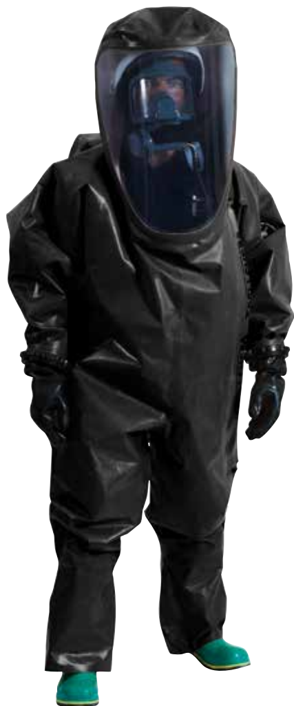
Type VP1 with sewn-in socks/booties and separate boots.

Provides maximum protection against hazardous chemicals in liquid, vapor, gaseous and solid form, including warfare agents. TRELLCHEM® VPS-Flash is fully certified in accordance with the American standard NFPA 1991:2016, including the optional chemical flash fire and liquefied gas protection requirements. The suit is also certified to the European standard EN 943-1 and EN 943-2.