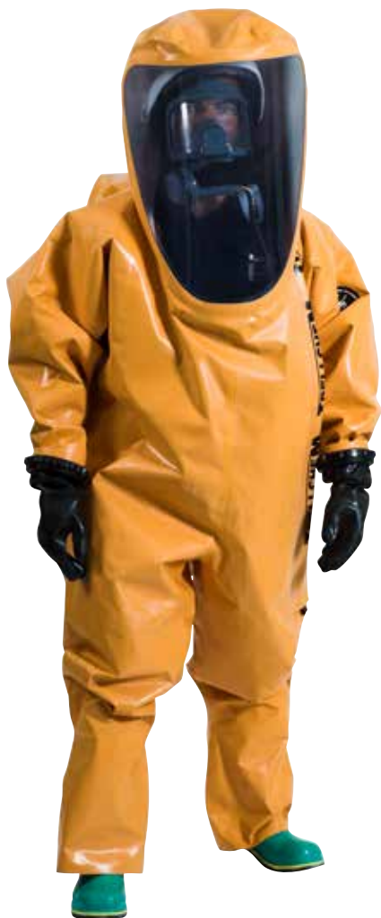
Type VP1 with sewn-in socks/booties and separate boots.

Provides maximum protection against hazardous chemicals in liquid, vapor, gaseous and solid form, including warfare agents. TRELLCHEM® VPS-Flash is fully certified in accordance with the American standard NFPA 1991:2016, including the optional chemical flash fire and liquefied gas protection requirements. The suit is also certified to the European standard EN 943-1 and EN 943-2.